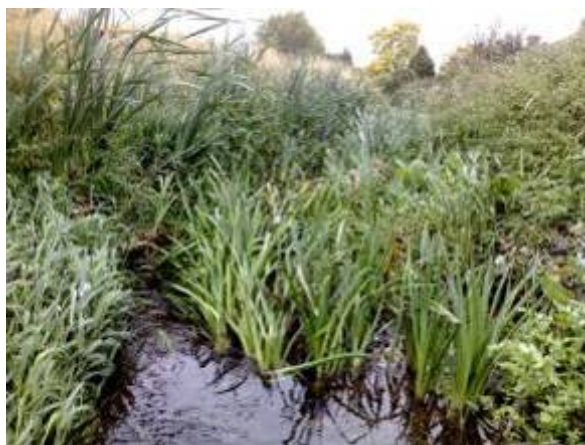
Figure 2.6: Mayes Brook at Reach 3 illustrating full summer foliage prior to trimming and potential for reed bed habitat

Restoration of Reach 3 comprises the most substantial element of the brook restoration. Works will include: