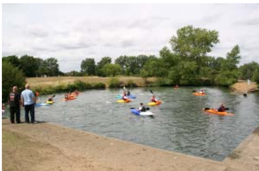
Figure 1.1: Kayaking at Mayesbrook Park

The lakes have become heavily polluted as they have served as a sink for substances from the Mayes Brook storm water overflow entering via the connecting high flow inlet channel. Three metres of polluted sediment have now accumulated in the top lake. The top lake has an overflow to the bottom lake, and there is a further outflow from the bottom lake into the Mayes Brook immediately before the brook flows through the screened entrance to the culvert downstream of Mayesbrook Park. Fishing and boating were historically popular activities on the lakes. However, both have now been stopped due to pollution concerns, although kayaking continues when conditions permit; with regular sessions run by the Barking and Dagenham Canoe Club on the upper lake, despite pollution and interruptions caused by unsafe levels of blue-green algal blooms.