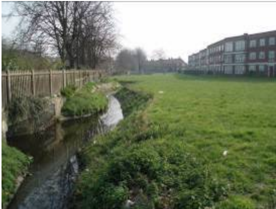
Baseline Study (Environment Agency, 2008d)

The trapezoidal channel is 300 metres long and fully reinforced along its length with brick tiles, although the brook is not completely straight. The channel is partially shaded by semi-continuous tree cover along the east bank. Inflows to the main channel include a large screened inlet immediately downstream of the emerging channel from the east. During site visits, this screen was heavily covered with litter. Two other smaller storm flow inlets were observed in this stretch, plus one additional land drain which is fully blocked with soil material.