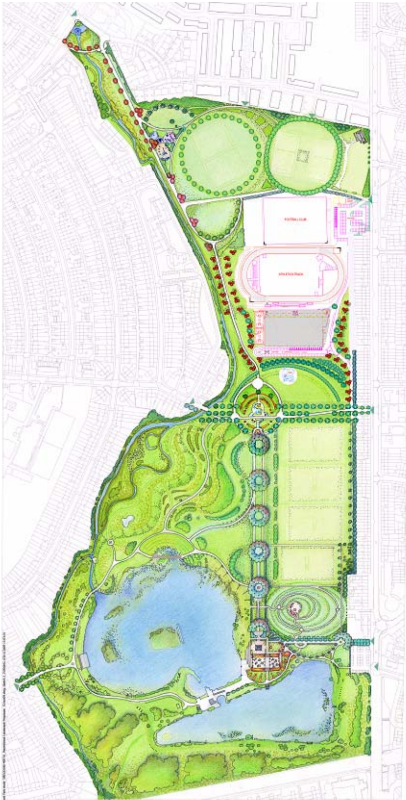
Mayesbrook Park Landscape Masterplan QD586_400_01_Rev E