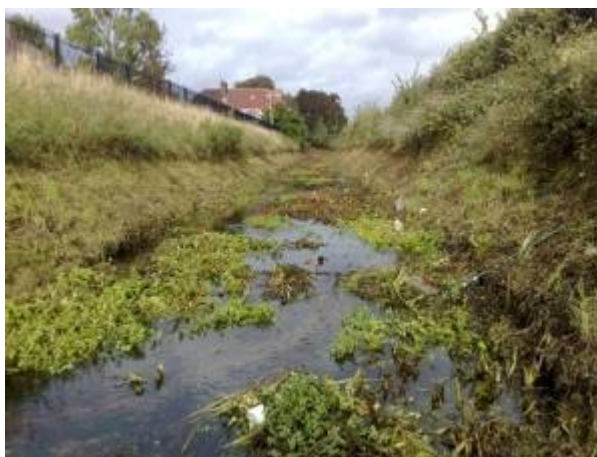
Figure 2.5: Mayes brook at Reach 2

The channel in Reach 2 has been re-sectioned to form an enlarged trapezoidal cross profile that is reinforced along the bottom of the bank and channel bed with concrete. However, these reinforcements are heavily overlain with sediments along much of the stretch to form a semi-continuous succession of sidebars dominated by emergent reeds and sedges including large stands of Branched Bur-reed ( Sparganium erectum ). These depositional features within the resectioned channel confine a narrower gravel bed channel that divides and meanders around the vegetated bars.