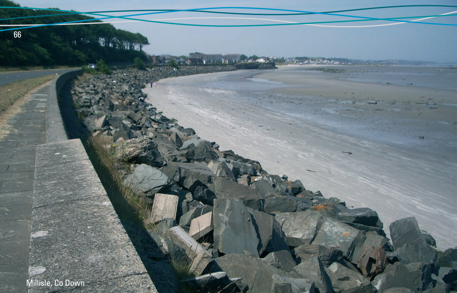
Millisle, Co Down

(e.g. Whiteabbey, Anne's Point) or the brackish water at the Quoile Pondage. These new habitats can be unique in character and can become important wildlife reserves.