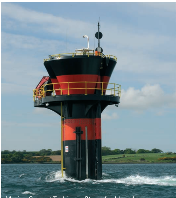
Marine Current Turbine in Strangford Lough

Much more information is needed on background noise levels, the noises of marine activities such as shipping and renewables and also on the impact of man-made noise on marine ecology.